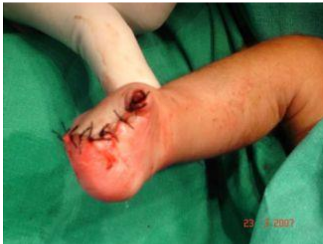
Fig. 3: Photomicrograph showing Herring-bone pattern and myxoid areas with increased mitotic figures suggestive of Infantile Fibrosarcoma. [ H & E stain 200X]