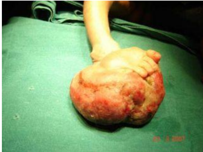
Fig. 2: Post-operative photograph after partial amputation of right foot.