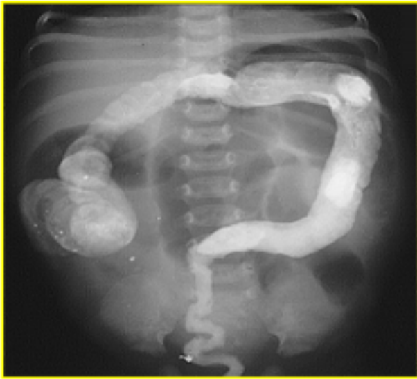
Figure 2. Barium enema of an infant with total colon aganglionosis.

None of the patients in both groups reported any fecal incontinence or constipation after surgery.