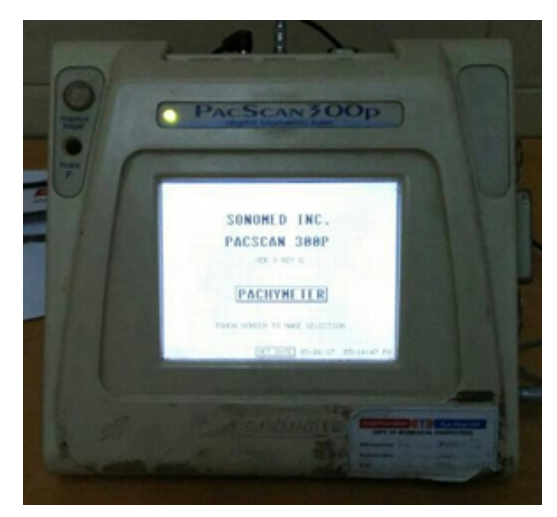
Figure 1. Ultrasound Pachymeter Pac Scan 300 P.

The ultrasound pachymetry instrument (Pac Scan 300 P) functions by measuring the amount of time (transit time) needed for ultrasound pulse pass from the one end of transducer to descemet's membrane and back to the transducer. The pachymeter used in our study is Pac Scan 300 P and is shown in (Figure 1). Thus the corneal thickness is equal to (Transit time × Propagation velocity)/2. The standard speed of ultrasound in cornea is 1640 m/sec. The probe handle has piezoelectric crystal which emits ultra-sonic beam of 20 MHz and also an interface between the cornea and transducer. The transducer sends ultrasound rays through the probe to the cornea and receives echoes from the cornea. Width of transducer beam is related to the size of the emitting crystal and of the width and configuration of the probe through which it passes. A wide probe tip and wide transducer beam reduces the accuracy of the corneal thickness reading at a single point. Therefore the diameter of the tip should not be more than 2 mm so as to diminish the area over which the ultrasound beam is spread and enables the observer to view exactly the position of the tip on the cornea. Surface of the tip should be smooth to avoid any injury to corneal epithelium.