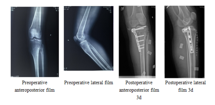
Figure 2. High tibial osteotomy.