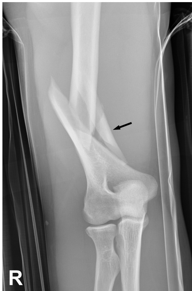
Figure 1. Initial x-ray. Anteroposterior view of the right arm shows a displaced oblique fracture of the distal shaft of the humerus with a large butterfly fragment (black arrow).