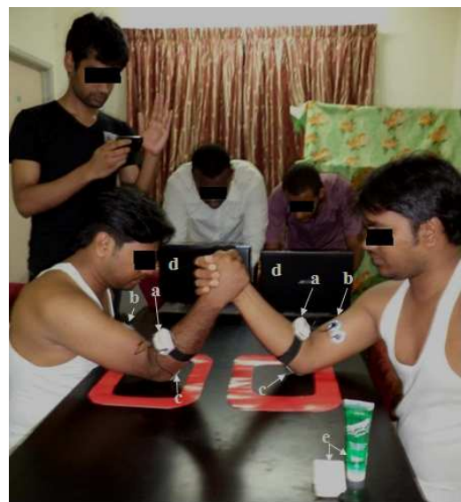
Figure 1. Experimental setup for EMG data recording: a) wireless EMG sensor attached within the daughter board; b) active electrodes; c) reference electrodes; d) Bluetooth-enabled laptop computers for recording the EMG signal within a 2 meter range; e) skin cleaning gel and alcohol swabs.

Ten healthy right-handed male subjects were participated in this experiment. The mean and standard deviation of the age, height, weight, and arm dimension during relaxation and during extension of the participants were 24.5±3.5 years, 168±6.7 cm, 70.5±8.3 kg, 11.82±1.5 inch, and 13.3±0.8 inch, respectively. The study was approved by the university research and development review board for human subjects. The ten subjects were divided into five pairs. The demographics characteristics of the two players in each group were almost identical. All participants gave written consent to take part in the study.