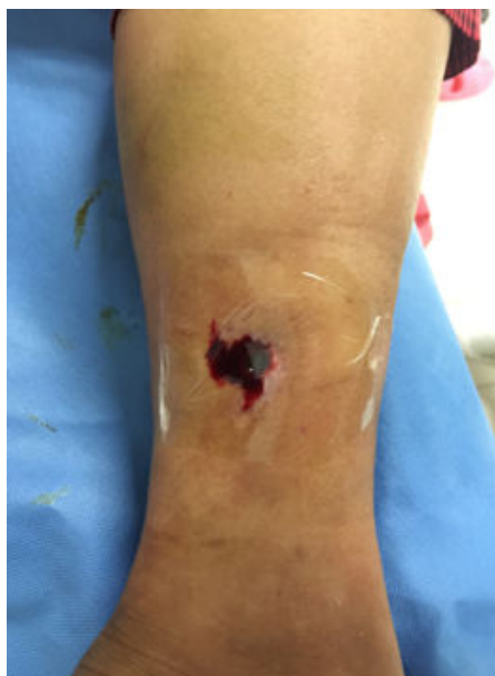
Figure 5. Cover the wound with sterile transparent membrane.

similar results have also been reported [8,17-19] which further confirm the significant therapeutic efficiency of PRP.