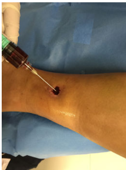
Figure 4. Inject the PRP into the wound through the sinus.