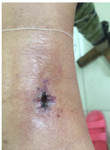
Figure 6. Wound healing.

The PRP is produced through the centrifugation of blood from patients. Therefore, PRP is very safe with high histocompatibility. In addition, the preparation of PRP is simple. However, the most important thing is, compared with the VSD therapy for the treatment of sinus wounds, the liquid PRP can be directly injected into the sinus and contact the sinus surface adequately regardless of the wound depth which makes full use of the contained cytokines. Generally, the PRP exhibits notable therapeutic effects for the treatment of refractory sinus wounds which provides a novel and effective way for similar wound healing in clinical treatment.