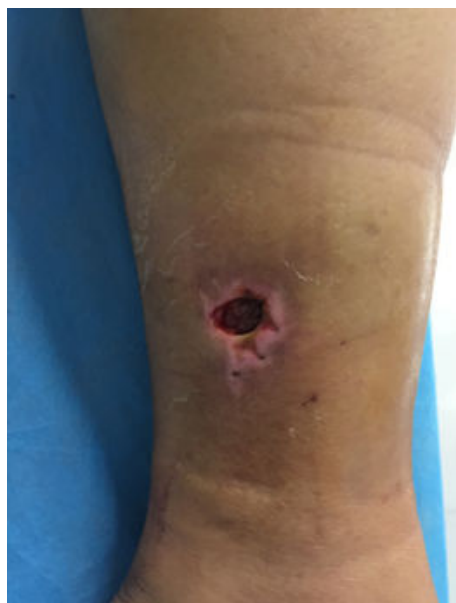
Figure 3. Sinus wound of the third patient.

2. Figures 1-6 show the treatment process and wound healing of the third patient.