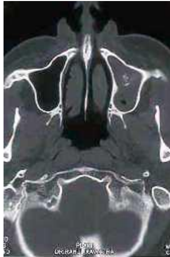
FIGURE I. Computed Tomography (CT Scan) showing opacification of the left maxillary sinus.