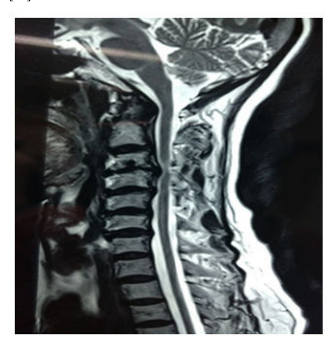
Figure 2. MRI cervical spine showing disc degeneration at C3/C4 level (cases).

This is a 60 year old male who presented with myelopathy features and sensory loss below C4 level. MRI showed evidence of C3/C4 PIVD. CT scan CV junction zoomed images were taken to see for calcification (Figures 2 and 3) [10].