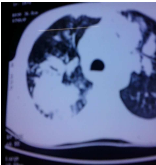
Figure 2. CECT Chest showing multifocal homogenous opacity Rt lung > Lt lung.