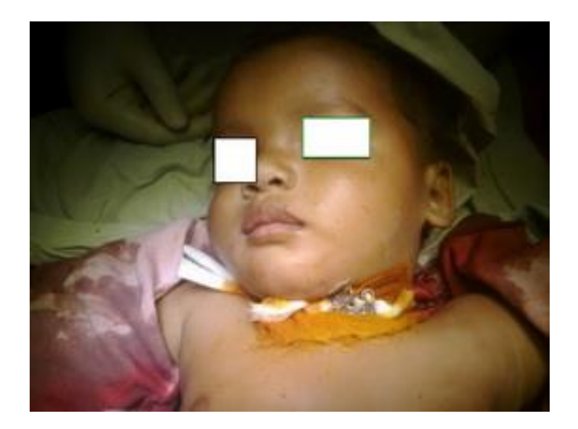
Figure 3: procedure completed.