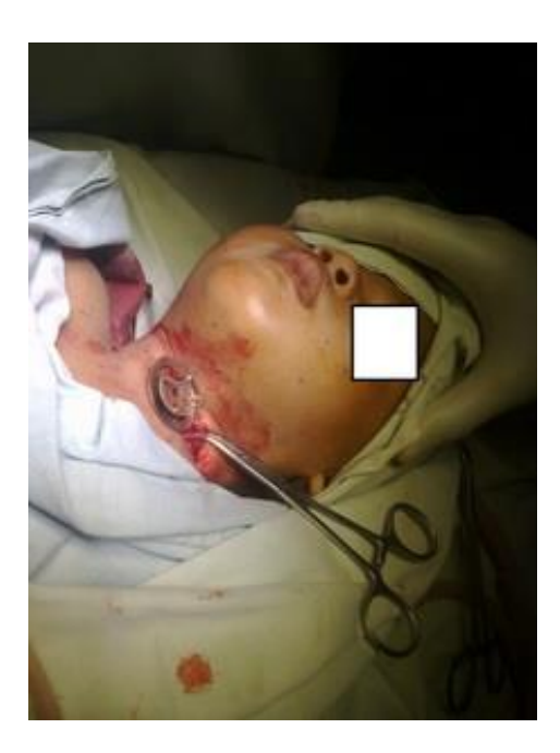
Figure 2 : airway and haemostasis secured.