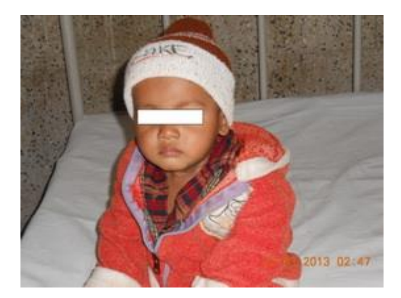
Figure 8: eight weeks post operative.