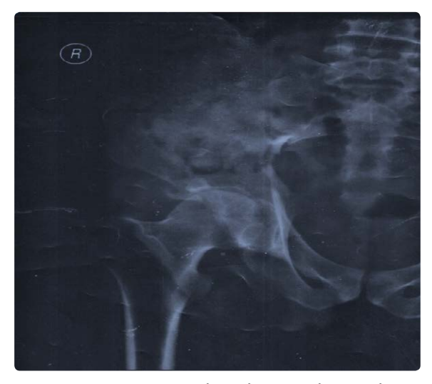
Figure 2. X-Ray right hemipelvis showing metastasis.

Thus, a strong possibility of distant metastasis should always be considered in symptomatic patients of advanced head and neck cancer.