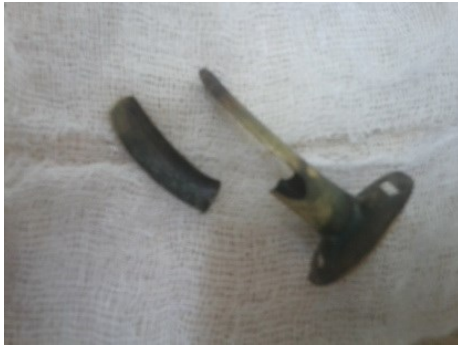
Fig. 2: The Broken Tracheostomy tube with the broken piece remove from the right bronchus.

The patient was thereafter kept under observation for next few days. Intravenous Ceftriaxone and Metronidazole were administered for 2 days. The patient subsequently stabilized but there was no improvement in his sensorium. He was subsequently discharged in a hemodynamically stable condition.