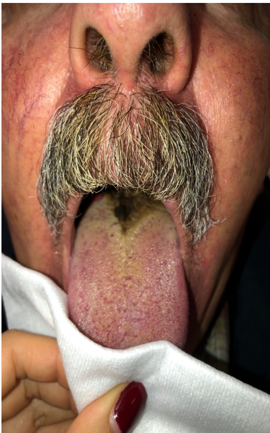
Figure 2: Improvement of black hairy tongue after 2 weeks of treatment

Two weeks after the beginning of the treatment and the cessation measures, all fulfilled by the patient, he noticed an improvement in oral discomfort and xerostomia. On objective examination, a slight decrease in the hairy appearance was noted, with improvement in the anteroposterior direction (Figure 2). The patient was encouraged to maintain the medical therapy, as well as the measures of smoking, alcohol, tea and coffee avoidance, and was reassessed again after 5 weeks of treatment, when it was possible to notice a normal appearance of the tongue, with no longer a black and hairy appearance (Figure 3). The patient was asymptomatic.