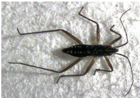
Figure 12. Mesoveliidae Family of Order Hemiptera.