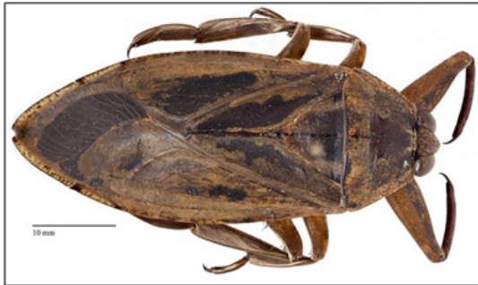
Figure 1. Belostomatidae family of Hemiptera .

more abundant in shallow and sunny patches of the wetlands, where the temperature was comparatively high than in deeper or shaded sites. These results showed that hydro period duration and temperature could be good regulators of voltinism and development in B. bifoveolatum , driving the population structure of this giant water bug at the southern end of its distribution range [41]. Figures 1-13 shows different families of Hemiptera as and semi and aquatic insects.