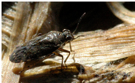
Figure 11. Saldidae Family of Order Hemiptera.