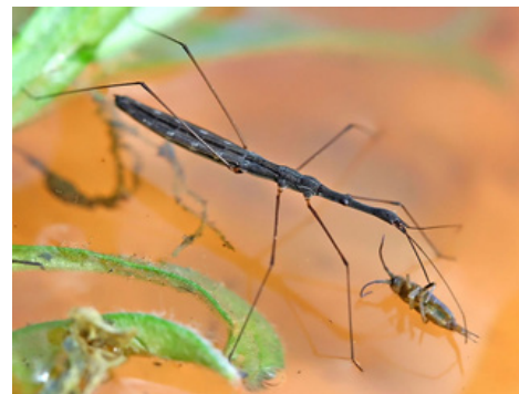
Figure 8. Hydrometridae Family of Order Hemiptera .