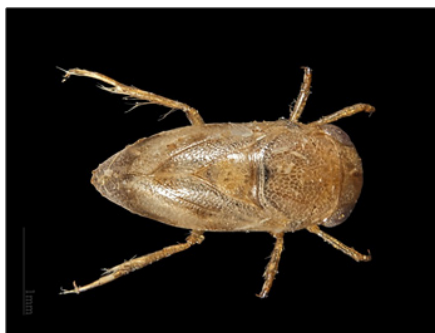
Figure 4. Peleidae Family of Order Hemiptera .