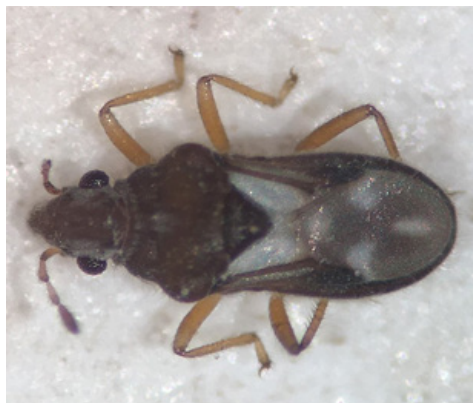
Figure 13. Heridae (Velvet water bugs) Family of Order Hemiptera.