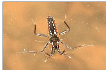
Figure 7. Vellidae (Riffle bug) Family of Order Hemiptera .