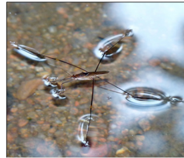
Figure 6. Gerridae (water strider) Family of Order Hemiptera .