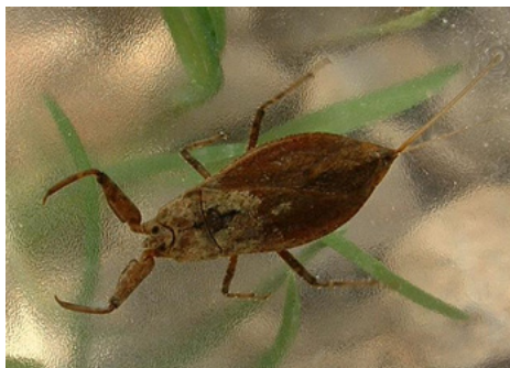
Figure 3. Nepidae Family of Hemiptera order.