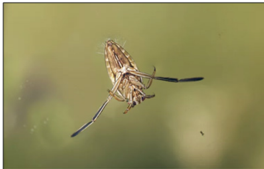
Figure 2. Notonectidae Family of Order Hemiptera .