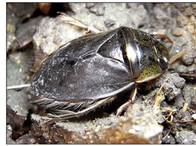
Figure 5. Naucoridae Family of Order Hemiptera .