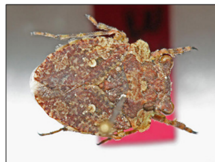
Figure 9. Gelasorocidae Family of Order Hemiptera .