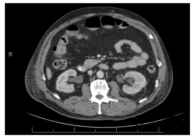
Figure 3. CT demonstrating lack of hydronephrosis despite obstruction.

Repeat imaging revealed minimal fullness of his right renal collecting system and normal left collecting system (Figure 3).