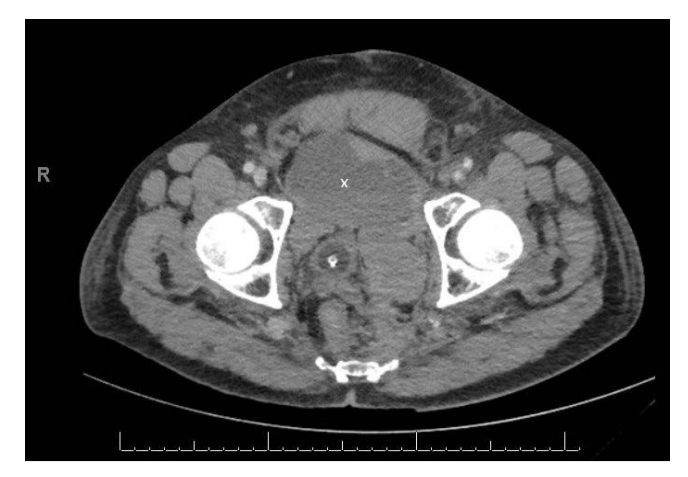
Figure 2. CT demonstrating pelvis (marked with "x") distorting catheterized bladder.

admission to 270 despite haemorrhage control, transfusion of packed red cells and adequate intravenous fluid resuscitation.