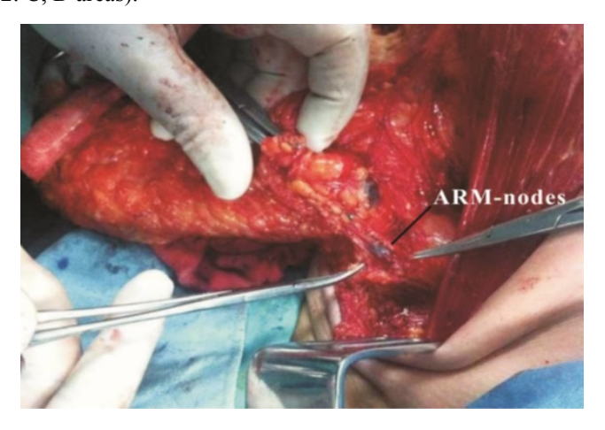
Figure 1. ARM-nodes.

(ARM-nodes, Figure 1), the majority of patients owned one node, and small number of patients owned 2-3 nodes, with an average of 1.12 ± 0.78, total of 31 ARM-nodes. Routine pathological examination showed that one ARM-nodes had isolated cancer nest and the remaining ARM-nodes were negative (Table 2); Most ARM-nodes were located in angle area 2 cm away of axillary vein and subscapular artery outside (Figure 2: A Area), and small part was located in axillary vein top level or the area near to head vein into axillary vein (Figure 2: C, D areas).