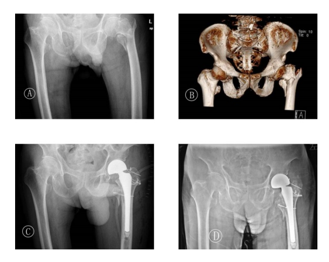
Figure 2. Typical male patient aged 85 who fell down and was diagnosed as Evans-Jensen type IV intertrochanteric fracture. Distally bone cement auxiliary biology stem of artificial femoral head replacement was performed at 62 h after the injury. Preoperative X-ray film and CT detected osteoporosis and medullary cavity was too spacious (A/B). X-ray film at 3 days after the surgery showed that the prosthesis location was good, and bone cement fixation distally and the prosthesis was stable (C). X-ray film during the 1, 5-year follow-up after surgery, although osteoporosis was aggravating, the prosthesis did not sink and the bone ingrowth of proximal HA coating area was satisfactory (D).