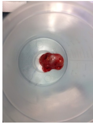
Fig 4 showing the removed mucous retention cyst from the maxillary sinus

With the help of zero degree endoscope and by forceps the retention cyst and glass foreign bodies were removed from the sinus. After bleeding control, drain was placed and without any complication we end the operation. After operation, the complaints of headaches and other ones regressed and patient had taken under rhinology clinic follow-up. We didn't see any postoperative complication along patient's six-month follow-up.