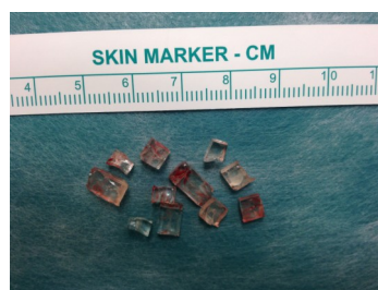
Fig 3 Showing glass pieces removed from the maxillary sinus