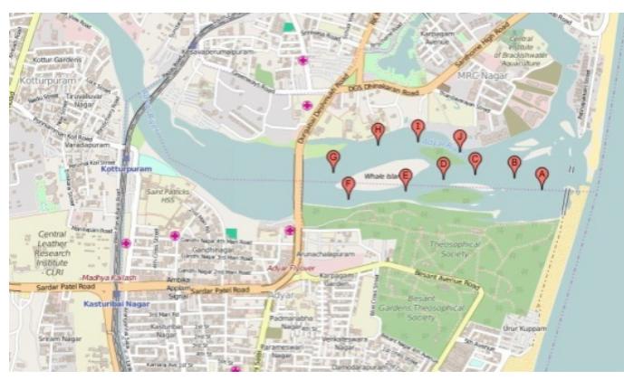
Figure 1. Sampling sites in Adyar Estuary.

The concentrations of heavy metal in water and sediment