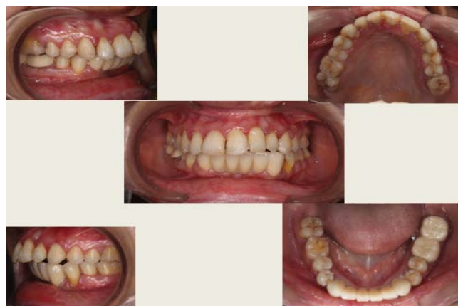
Figure 3(b). Post Treatment – Intra Oral.