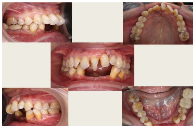
Figure 1(b). Pre-Treatment- Intra Oral.