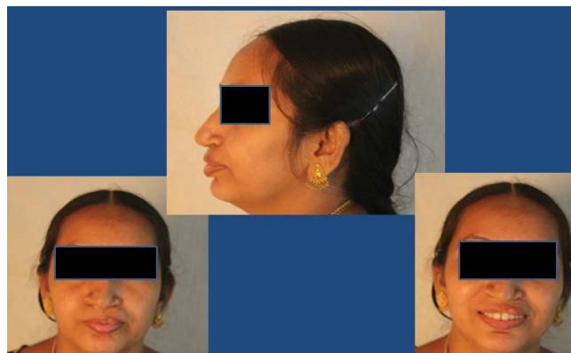
Figure 3(a). Post Treatment- Extra Oral.