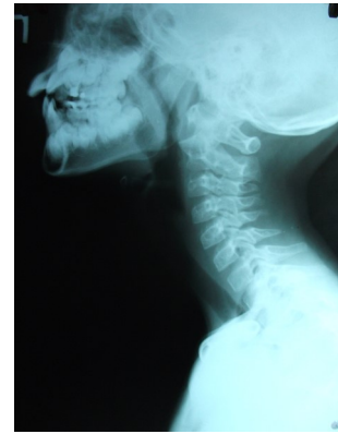
Figure 3 X-ray neck , nasopharynx lateral view, with enlarged adenoids