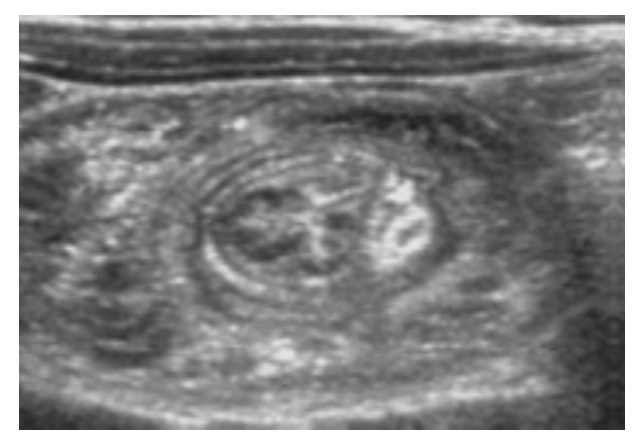
Figure 1. Ultrasound image showing a length of intestine inside another length: A 'pseudo-kidney'.

Intussusception is a process in which a portion of intestine invaginates into itself. It is a rare etiology of neonatal intestinal obstruction since it occurs with an incidence of 0.3% to 1.3% in newborns [1]. It is exceedingly rare in premature neonates. This disease is more common in boys, with a ratio of 3:2. In most cases, the cause remains unclear. However, in full term neonate with intussusception, a lead point is present in approximately 58% of patients [2], such as duplication cyst, hamartoma,