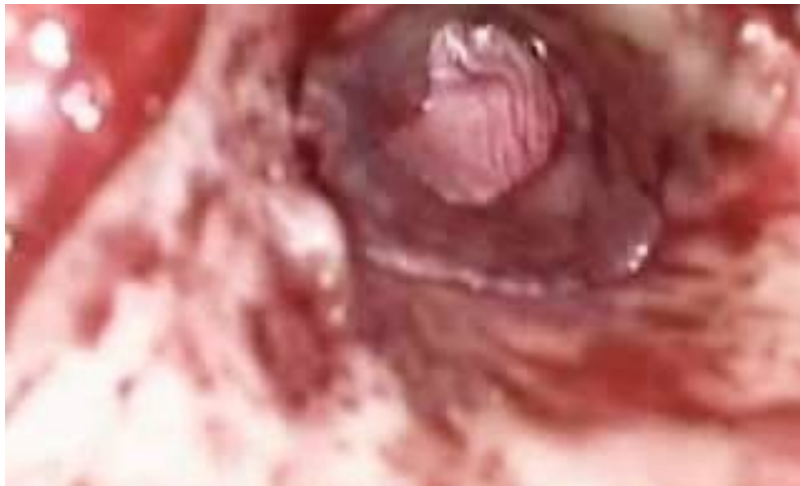
Fig 3 underlay myringoplasty done and PRF placed in myringoplasty site.

X-ray finding the surgical procedure was planned. Patients with sclerosed mastoids and clouding of air cells underwent cortical mastoidectomy with myringoplasty with or without ossicular reconstruction. Patients with cellular mastoid underwent myringoplasty alone with or without ossicular reconstruction 5 . Under lay myringoplasty was done and platelet rich fibrin was placed over the myringoplasty site.