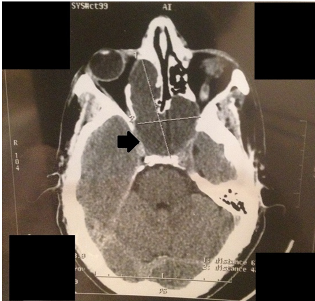
Figure 1: Axial CT revealed a large mass in sphenoid sinus with extension into the right ethmoidal with marked thinning of the internal wall of the orbit.