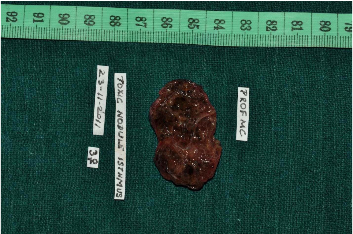
Image showing cut section of the specimen