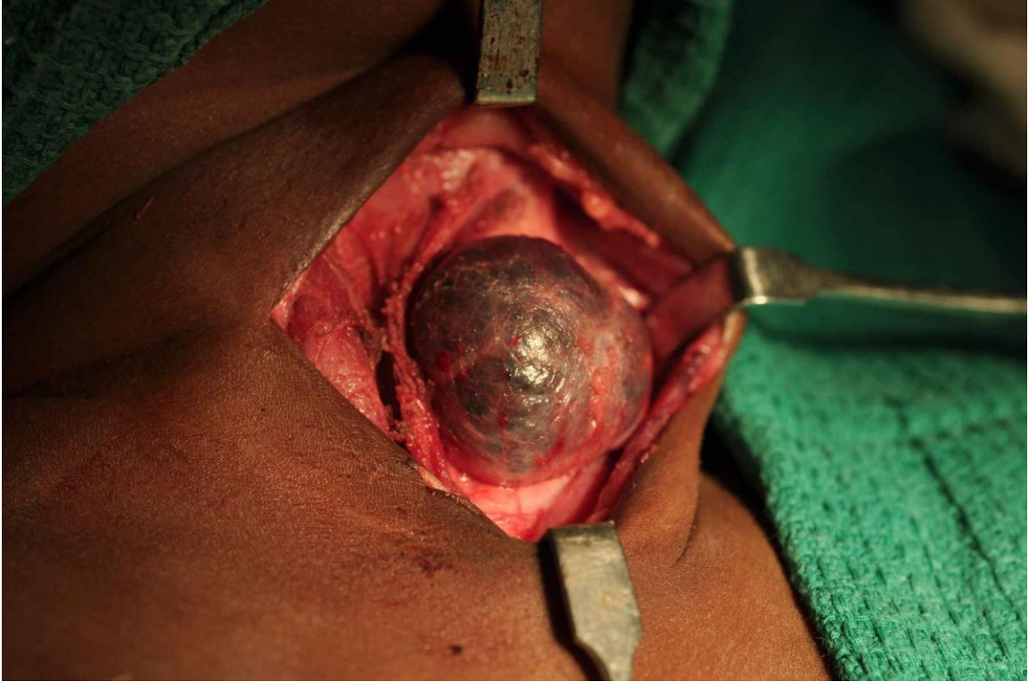
Per operative picture showing nodule arising from isthmus region