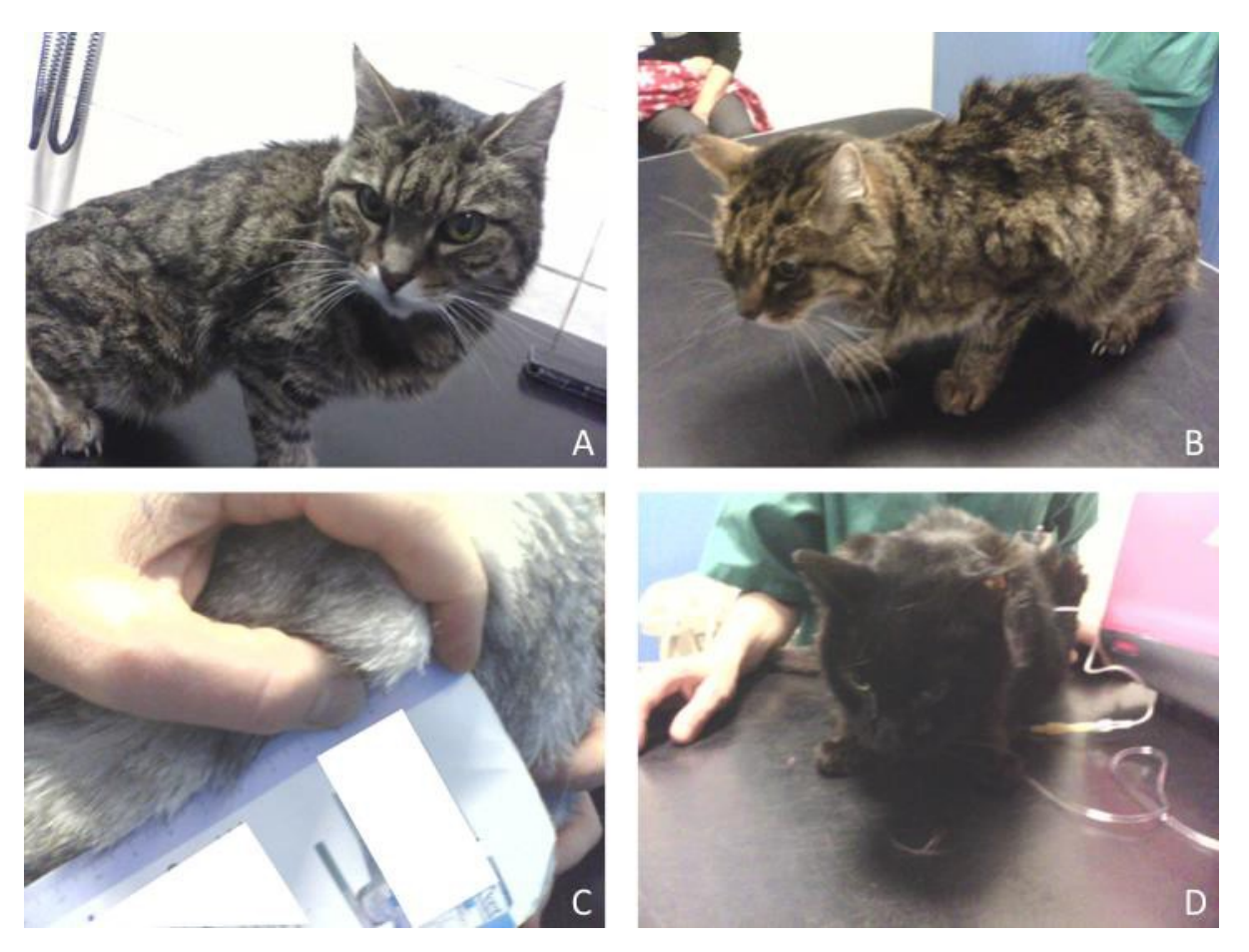
Figure 1. Cats enrolled in the evaluation. (A, D) European cat with stage IV digestive system lymphoma; (B) European cat with small intestine adenocarcinoma; (C) European cat with cutaneous fibrosarcoma.

Citation: Guazzi P, Suzawa M, Di Cerbo A. Effectiveness of a formulated product (Gold Lotion) in improving the quality of life (QoL) of oncological cats: preliminary results.. J Vet Med Alled Sci 2017;1(1):1-4.