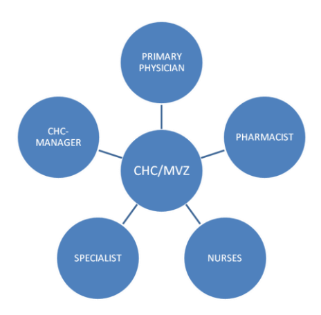
Figure 1 MEDICAL ACTORS WITHIN AN CHC/MVZ (OWN ILLUSTRATION)

The management of the MVZs varies between the three MVZ categories as follows: