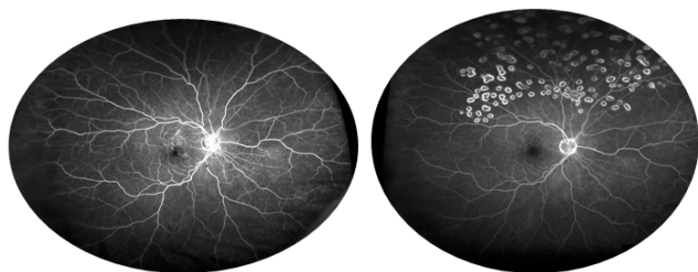
Figure 1. REVOLUTIONARY treatment strategy in right eye of patient with macular edema secondary to branch retinal vein occlusion in superotemporal distribution. Left: baseline UWFA demonstrating late leakage in the macula and peripheral nonperfusion superotemporally and Right: 12-month UWFA demonstrating no late leakage in the macula and peripheral scatter laser in distribution of nonperfused area superotemporally; there was progressive improvement in visual acuity and resolution of intraretinal fluid on OCT.

Citation: Suñer IJ, Suñer IA, Peden MC, et al. The REVOLUTIONARY trial: A pilot study to assess the efficacy, durability, and safety of combination ranibizumab + peripheral scatter laser for macular edema secondary to branch retinal vein occlusion associated with peripheral nonperfusion on ultrawide-field angiography. J Clin Ophthalmol. 2018;2(2):80-5.