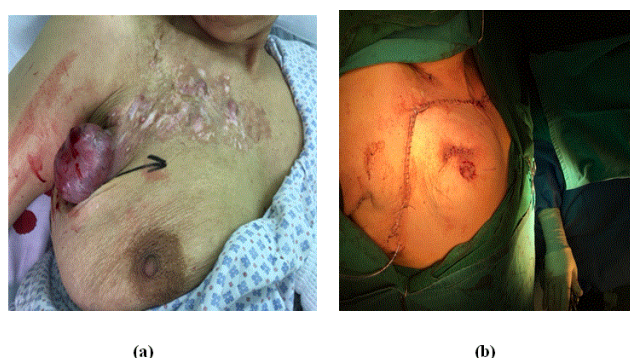
Figure 1. (a) Pre-operative recurrent dermatofibrosarcoma protuberans (DFSP) and (b) post-operative recurrent dermatofibrosarcoma protuberans (DFSP).

There are two forms of recurrence after soft tissue sarcomas surgeries including both local recurrence and distant metastasis. These types of recurrence are influenced by many factors such as degree of differentiation, histological type, margin and extent of resection, and perioperative radiotherapy [11]. Around 25% of the patients develop recurrence after successful surgery of the primary site. But the incidence of recurrence can increase up to 40% to 50% if the tumor is greater than 5 cm in size or poorly differentiated, deep to fascia [12] (Figures 1 and 2).