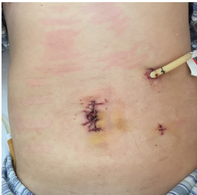
Figure 4. The incision and the port sites were closed with interrupted sutures.

The total surgical specimen length was 28.5 cm (6.5 cm terminal ileum segment and 22 cm colon segment). There were 39 lymph nodes isolated. The pathological result was moderately differentiated adenocarcinoma, stage as III (T3N1aM0), positive for extramural vascular invasion. Postoperative pain control was maintained through patient-controlled analgesia for the first 24 hours. The patient stayed afebrile throughout his postoperative course. Water was given on postoperative day 1. While bowel activity (as evidenced by flatus) occurred postoperative day 2, liquid diet was started, and drainage was removed. On postoperative day 3, the patient was advanced to low-residue diet. Finally, the patient was discharged on postoperative day 5. He was referred to adjuvant chemotherapy 30 days later. One year follow-up showed no complication or recurrence.