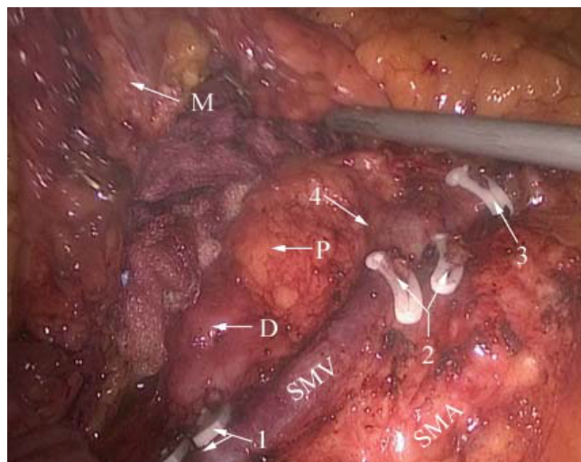
Figure 3. Branches (ileocolic vessels, right colic vessels, and right colic vessels) were dissected.

opening. After the specimen was removed, the end-to-side anastomosis was performed. The end of small intestine was then brought up to the side of the large intestine. Drainage was placed adjacent to the anastomosis through the left 12 mm port site. The incision and the port sites were closed with interrupted sutures (Figure 4). The total operative time was 144 min with an estimated blood loss of 30 ml and an intraoperative urine output of 550 ml.