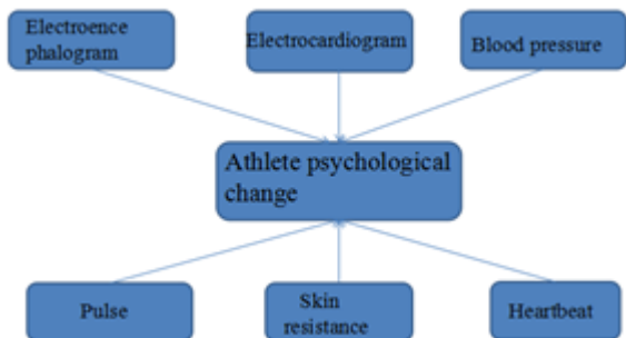
Figure 1. Factors influencing the psychological change of athletes.

written test and instrument measurement. The factors influencing the psychological changes of athletes are shown in Figure 1.