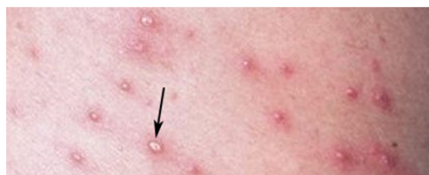
Figure 2. Severe skin rash.

On the hand, the 7 students who had no vaccination history had average body temperature of 40.36 \pm 0.46^\circ\text{C} and over 50 skin lesions, with mean lesion number of 64.78 \pm 4.31 ( p < 0.05 , relative to students with inoculation history).