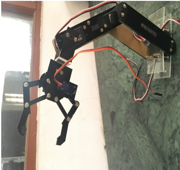
Figure 3. Robotic arm.

discrepancy in the functioning of flex sensor could be due to human error. The functioning of the robotic arm has been found to be 95% efficient. The 5% error seen is due to the variations in the output of the flex sensor. Minute errors could also be due to coding discrepancies.