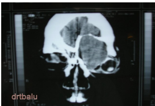
Coronal CT scan showing proptosis due to frontoethmoidal mucocèle