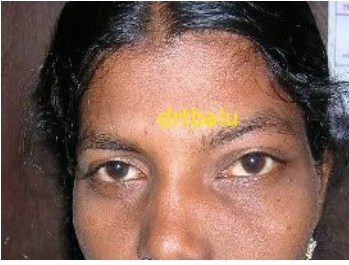
Image showing proptosis due to fibrous dysplasia