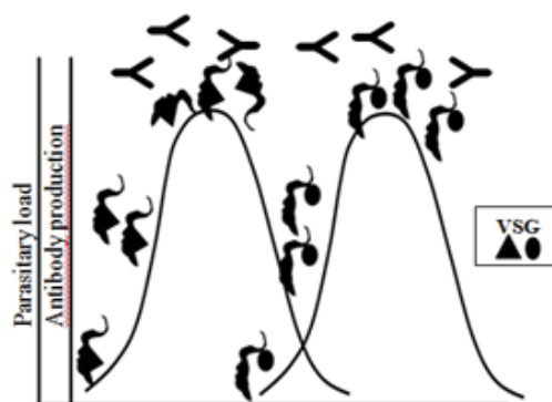
Figure 2. Antigenic variation of T. brucei .

The persistence of T. brucei in the blood is possible due to its capacity of perform the mechanism of antigenic variation, a spectacular process that allows to evade the attack of the host's humoral immune system, that consists in the periodically switching of their major variant surface glycoprotein (VSG), that shield the cell surface from immune effectors [32]. VSG forms a physical coat barrier that protects plasma membrane components of the parasite from exposure to innate and adaptive immune attack. In the course of infection in the mammalian they are produced VSG specific antibodies that eliminate some parasites, others escape from recognition of the antibodies by switching expression to antigenically distinct VSGs, that is to say, "they change their shirts" to avoid being recognized (Figure 2) [33].