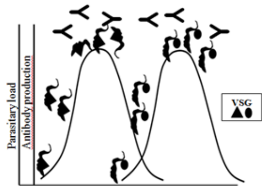
Figure 2. Antigenic variation of T. brucei .

The persistence of T. brucei in the blood is possible due to its capacity of perform the mechanism of antigenic variation, a spectacular process that allows to evade the attack of the host's humoral immune system, that consists in the periodically switching of their major variant surface glycoprotein (VSG), that shield the cell surface from immune effectors [32]. VSG forms a physical coat barrier that protects plasma membrane components of the parasite from exposure to innate and adaptive immune attack. In the course of infection in the mammalian they are produced VSG specific antibodies that eliminate some parasites, others escape from recognition of the antibodies by switching expression to antigenically distinct VSGs, that is to say, "they change their shirts" to avoid being recognized (Figure 2) [33].