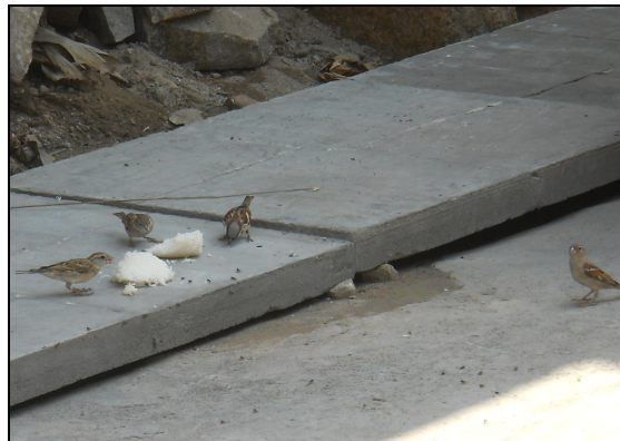
Figure 3. Availability of food for the sparrows in the rural area.