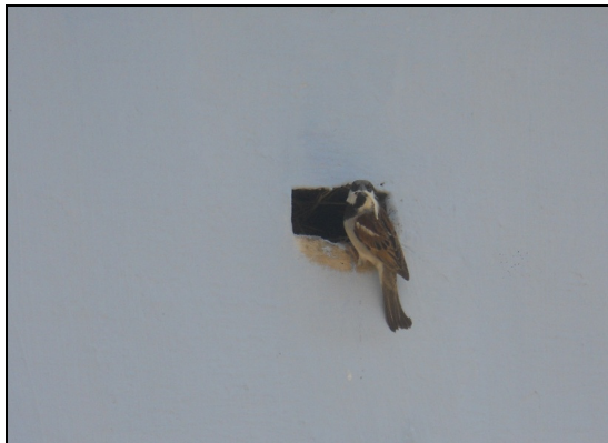
Figure 4. House sparrow nest in crevices at Kalayarkuruchi village.