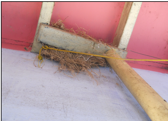
Figure 2. Old storey building in Pudhukotai village.