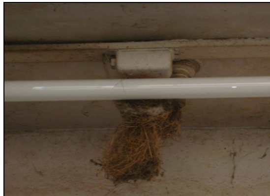
Figure 5. Nest of house sparrow hanging from tube light in Sivakasi town.