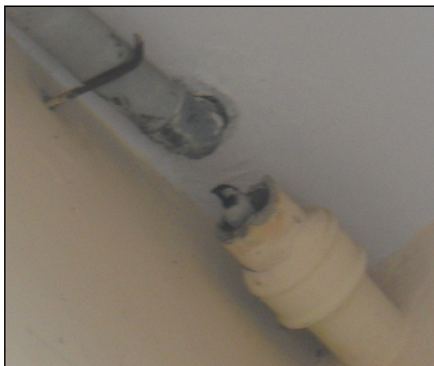
Figure 6. House sparrow nest in pipelines of Sivakasi town.

The availability of food, such as, grains, insects, especially caterpillars and the suitable nesting sites could be important factors for the high density of sparrows in the rural areas. In the present investigation the large number of house sparrow were found in rural areas and this may due to the availability of suitable habitats, such as, nesting sites and feeding sites. The percentage of old storey buildings and the availability of food were maximum in the rural areas (Plate 1 & Table 2). The large number of house sparrows in villages was observed in Naranapuram and Duraichampuram due to availability of grains and agricultural practices throughout the year. The number of sparrows on different study locations was significant in all the seasons at 5% level of significance. Simwat