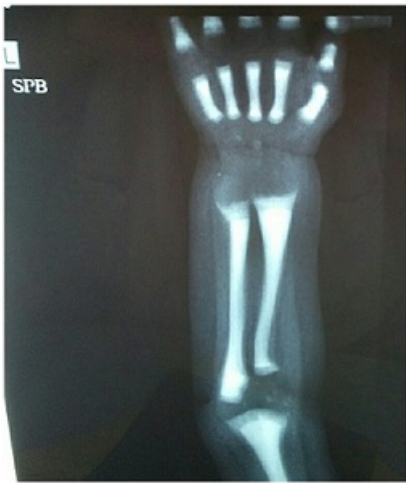
Figure 2: X-ray with markedly increased bony density.

which is the reason for leucoerythroblastic blood picture and hepatosplenomegaly. Leucoerythroblastic blood picture, cytopenias and extra medullary hematopoiesis are consistently seen with these cases. So it can be a pointer towards this disease. Based on peripheral smear findings, bone marrow pathology including leukaemia, metastasis or infiltrative bone marrow disease (storage disease) were considered in differential diagnosis. Bone marrow trephine biopsy usually in such cases shows narrowing of bone marrow spaces with marked hypocellularity, markedly suppressed erythropoiesis, granulopoiesis and megakaryocytes. There is abnormal bone formation with thickened multiple disorganized bony trabeculae with areas of patchy reticulin fibrosis and several interrupted pieces of ossified cartilage. The disease has poor outcome and is fatal in most cases.