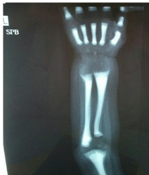
Figure 2: X-ray with markedly increased bony density.

Plain radiograph of left Forearm and wrist revealed generalized increase in bone density and bone within bone appearance which is characteristic of infantile malignant osteopetrosis (Figure 2).