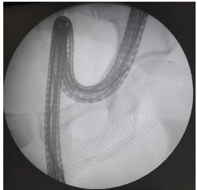
Figure 1. Fluoroscopy showing a U-shaped loop of the colonoscope was trapped in the left inguinal hernia.

complained of discomfort in the left inguinal region. Simultaneously, the left inguinal mass increased significantly. Immediate computed tomography showed a folded intestinal tract in the hernial sac (Figure 2). Therefore, emergency left inguinal hernia repair was performed. The sigmoid colon was identified as the contents of the hernia. Conspicuous adhesion was detected between the sigmoid colon and the hernial sac (Figure 3). The patient made an uneventful recovery.