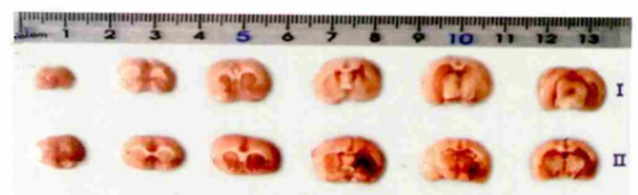
Figure 2. Coronal section of brain tissue. I. Normal control group; II. Model group.