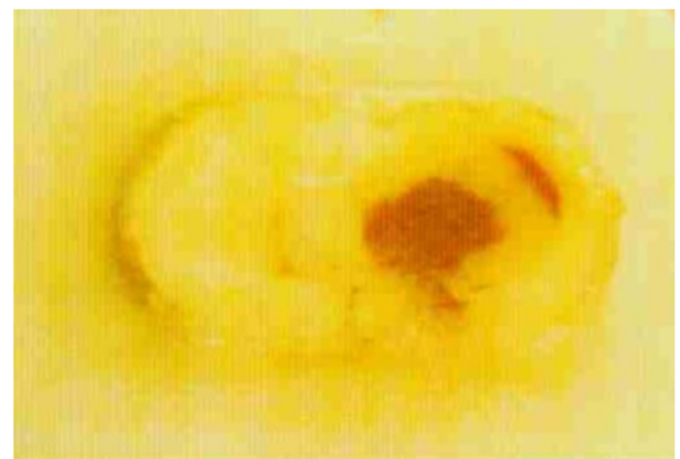
Figure 1. Hemorrhage of right caudate nucleus in mice.

There were no obvious changes and hematoma in the brain tissues of the normal control group. In the model group, there were different degrees of destruction and edema in the cerebral hemorrhage area and its surrounding brain tissues (Figure 2).