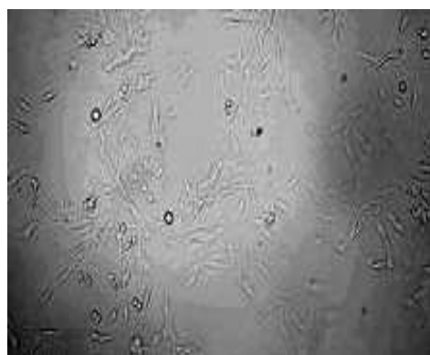
A Control group

Under inverted microscope, cells in the control group were grown adherently, with intact membranes. Growth density of cells in the Hedyotis diffusa Willd. test groups became gradually low with increasing drug concentration. Cell surface was wrinkled. In the high concentration group, most cells were disrupted, cell morphology was not intact, and number of adherent cells was reduced. The results are shown in Figure 1.