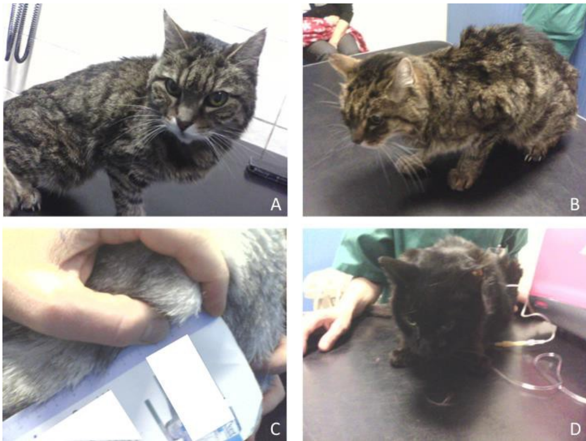
Figure 1. Cats enrolled in the evaluation. (A, D) European cat with stage IV digestive system lymphoma; (B) European cat with small intestine adenocarcinoma; (C) European cat with cutaneous fibrosarcoma.

Citation: Guazzi P, Suzawa M, Di Cerbo A. Effectiveness of a formulated product (Gold Lotion) in improving the quality of life (QoL) of oncological cats: preliminary results.. J Vet Med Allied Sci 2017;1(1):1-4.