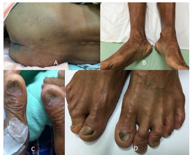
Figure 1. Systemic skin hyperpigmentation, dystrophic nail changes of the patient. A and B showed the hyperpigmentation in the trunk and legs. C and D showed onychodystrophy in fingers and toes.

retention polyps with cystically dilated glands filled with mucus in an edematous and inflamed lamina propria mainly composed of plasma cells, neutrophils, and eosinophils. IgG4-positive plasma cells were seen with uneven distribution (Figure 3). Focally, the number of IgG4-positive plasma cells was up to 30 in one high power field. The IgG4 to IgG-positive cell number ratio was around 40%. Helicobacter pylori was negative.