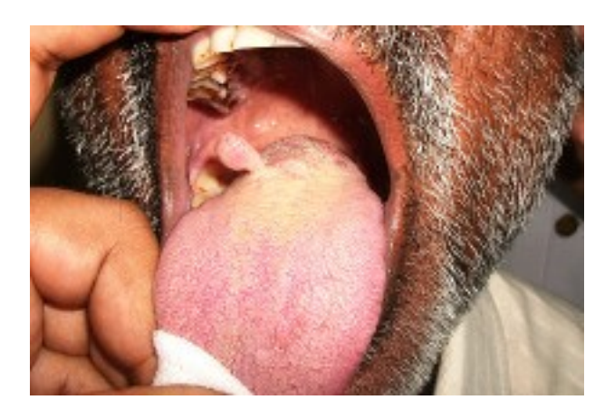
Fig 2 showing accessory tongue on protrusion of tongue