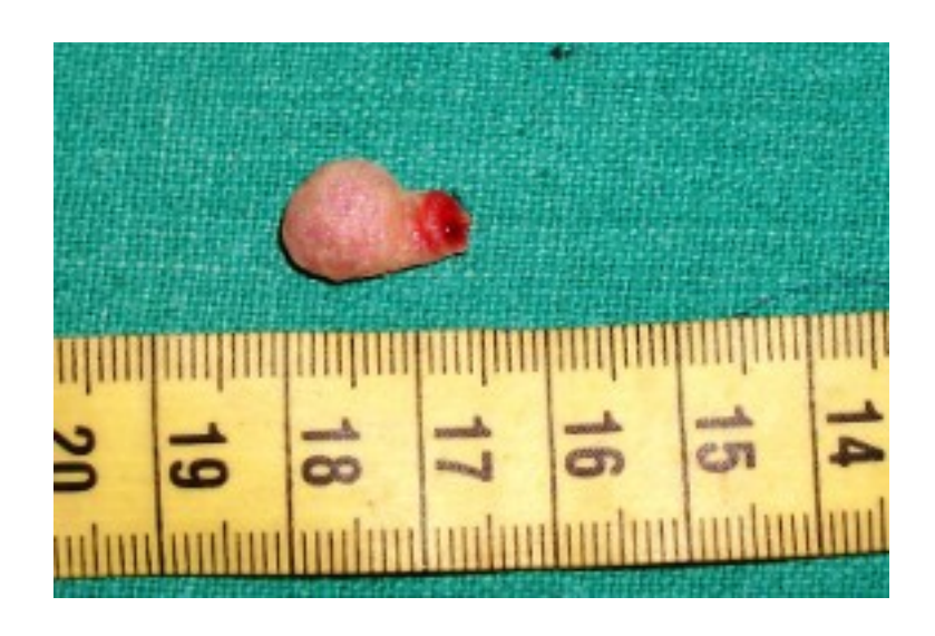
Fig 3 Gross specimen after excision