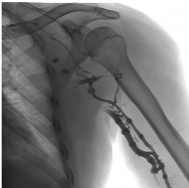
Figure 1. The patient was a male 23 y old. His testicular seminoma was under chemotherapy, the left PICC had been inserted for two weeks and the left upper limb had been under swelling for two days.

The 19 patients were followed for 6-36 months (mean 13.06 ± 11.22 months). Among them, 14 patients died of the primary tumor and associated complications in 6-20 months. During the follow-up, the swelling, pain and other symptoms at the affected extremities disappeared in all patients and they were not uncomfortable when moving, and there were no varicosity or other reflux disorder symptoms. Ultrasonic examination showed that there was no recurrence or progression of thrombosis and the deep vein valve function was normal.