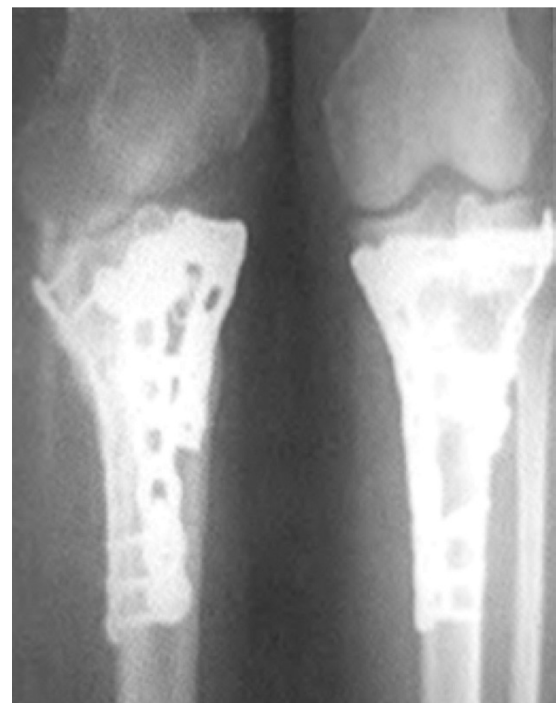
Figure 3. Imaging of internal fixation using inner-side supporting board plus "Raft" locking plate for complex tibial plateau fracture involving posteromedial column.

Imaging of fixation in group A was shown in Figure 3. The general fixation operation was as follows: the patients received the general anesthesia. The intravenous infusion of antibiotics was performed at 30 min before surgery. The anterolateral incision and the medial inverted "L" or straight incision were selected. After determining the joint surface as good by X-ray, the external joint was fixed using the "Raft" locking plate fixation, and the medial side was fixed using 3.5 mm supporting board. The imaging of fixation in group B was shown in Figure 4. The euthyphoria reduction was performed on the posterolateral tibial plateau fracture. After confirming that the fracture block and articular surface collapse obtained satisfactory reduction, the lower platform grafting was conducted, followed by fixation using lateral 3.5 mm "T" shaped plate.