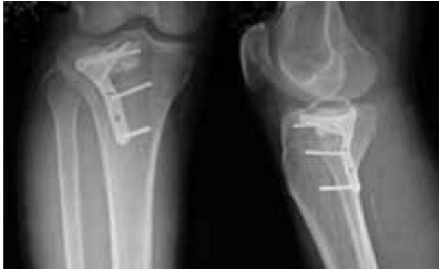
Figure 4. Fixation using lateral "T" shaped plate for complex tibial plateau fracture involving posteromedial column.