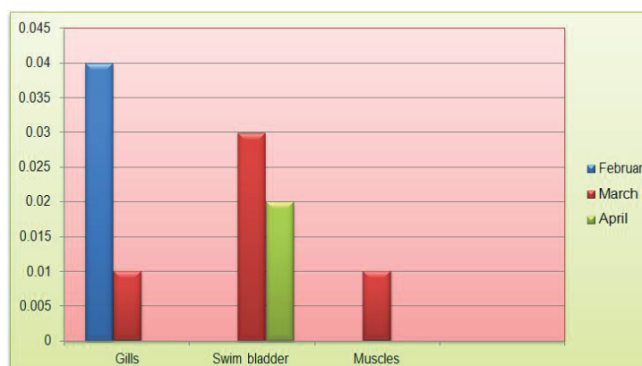
Figure 2: Showing comparative result of lead concentration observed in February, March and April.