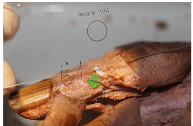
Figure 2. Arrangement of the dorsal branch of the digital artery's median segment of the median joint. 1: Dorsal branch of the digital artery's median segment of the median joint; 2: Branch point of the dorsal branch of the digital artery's median segment of the median joint; 3: Nail fold; 4: Distal dorsal branch of the digital artery; 5: Included angle of the digital artery and the dorsal branch of the median segment of the median joint; 6: Vessel network at the place of the nail fold.

The dorsal vessel perforator branch of the digital artery in the median segment of the median joint was arranged toward the distal joint; one-third part of the inner part of the nail fold corresponded with the identical vessel on the opposite side and the distal dorsal branches of the digital arteries on two sides, thereby forming an approximate "π"-shaped vessel network structure. This dorsal branch was the trunk perforator vessel that passed through the median joint and distal finger, had large starting and ending outer diameters, and was arranged in a straight fashion. Blood supply to the flap was from the matched blood network of the constantly thick dorsal branch of the median joint and the distal dorsal branch of the digital artery (Figure 2).