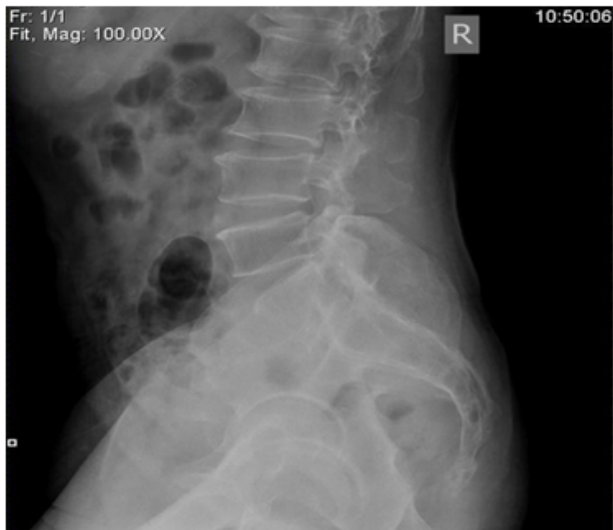
Figure 4. X-ray image of patient with waist injury.