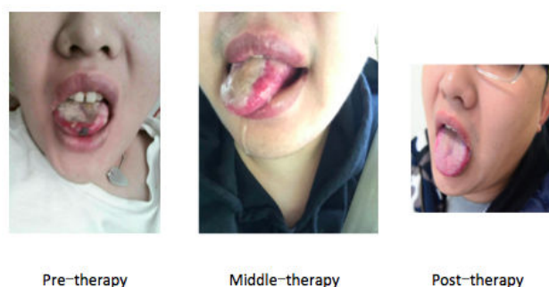
Figure 2. The response comparison between pre-therapy and post-therapy.

The reduction in the cell number of CD4 (+) CD25 (+) Foxp3 (+) Treg at the molecular level and peripheral blood would increase the prevalence rate of recurrent oral ulcer. In addition, indolamine 2, 3-dioxygenase mRNA played an important role in protecting patients with recurrent oral ulcer [19]. What's more, as ulcer developed, TNF- \alpha and IL-2 level rose and IL-10 level trended to be normal. There were many different allergies in milk. And casein, \beta -milk protein and \alpha -milk protein were the most common allergens. In most cases, milk allergy was caused by the above 3 allergens [20,21], possible CMA mechanism has been shown in Figure 3. More mechanism or an unclear antibody or a factor needs to be investigated in detail.